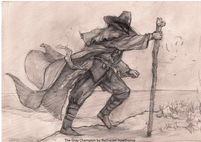
The Gray Champion by Nathaniel Hawthorne

"Long, long may it be, ere he comes again! His hour is one of darkness, and adversity, and peril. But should domestic tyranny oppress us, or the invader's step pollute our soil, still may the Gray Champion come" — Nathaniel Hawthorne,